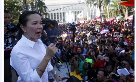
Philippine presidential candidate Grace Poe at an International Women's Day rally in Manila.

museum memorializing her ordeal. In India, protesters demanded equal representation for women. In Bangladesh, garment workers demanded equal pay, an end to violence against women and safe working conditions. And in Poland, men bought flowers.