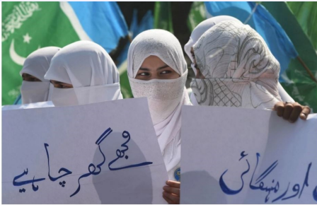
Supporters of Pakistan's Islamist party Jamaat-e-Islami (JI) rally on International Women's Day in Lahore. Women in conservative Pakistan have fought for their rights for decades, in a country where so-called honor killings and acid attacks remain commonplace.

Yes, there is a Google Doodle. But around the world, people took the celebration of International Women's Day from the virtual realm into the streets —