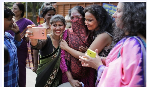
Women's rights activists take selfies with activist-turned-politician Soni Sori and a victim of an acid attack, center with face covered, during a protest march on International Women's Day in New Delhi.

"The story of women's struggle for equality belongs to no single feminist nor to any one organization but to the collective efforts of all who care about human rights," political activist and renowned feminist Gloria Steinem said in a statement.