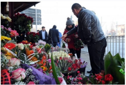
A flower seller in Poland.

Celebrated on March 8 for more than 100 years, International Women's Day comes with a U.N.-approved theme. This year's is "Planet 50-50 by 2030: Step It Up for Gender Equality" — a reference to the U.N.'s "2030 Agenda